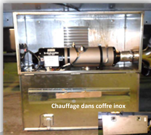
Chauffage dans coffre inox