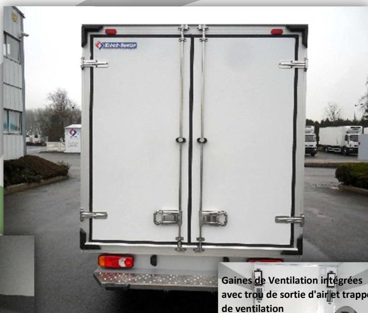
Gaines de Ventilation intégrées avec trou de sortie d'air et trappe de ventilation