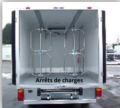
Arrêts de charges