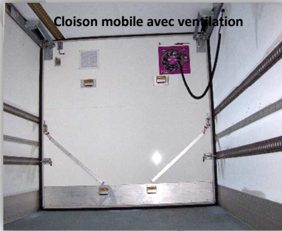
Cloison mobile avec ventilation