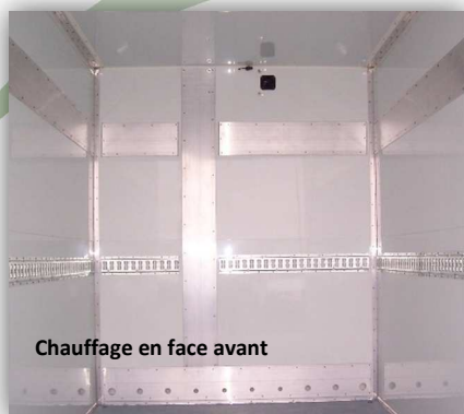
Chauffage en face avant