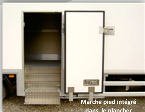
Marche pied intégré dans le plancher