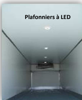
Plafonniers à LED