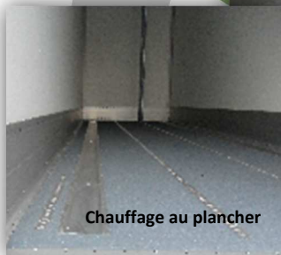
Chauffage au plancher